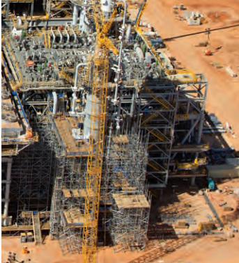
Chevron-operated Gorgon Project.