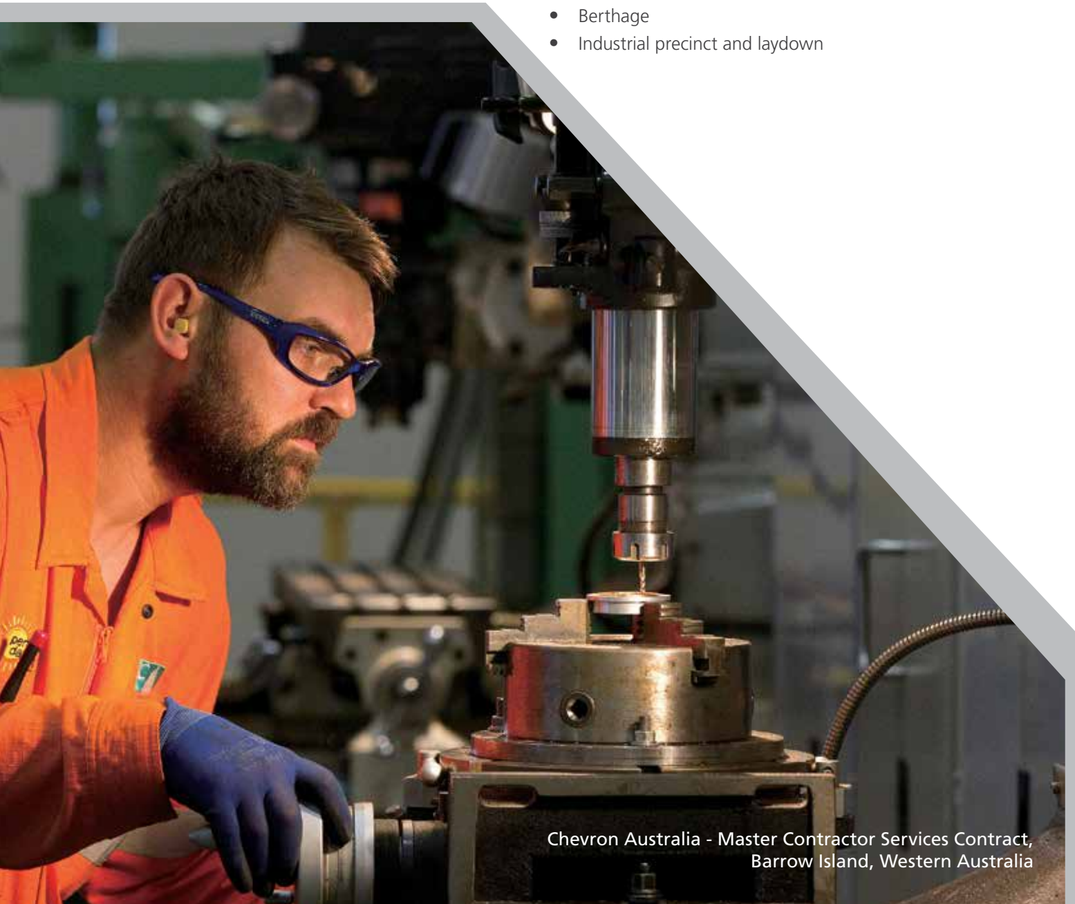
Chevron Australia - Master Contractor Services Contract, Barrow Island, Western Australia