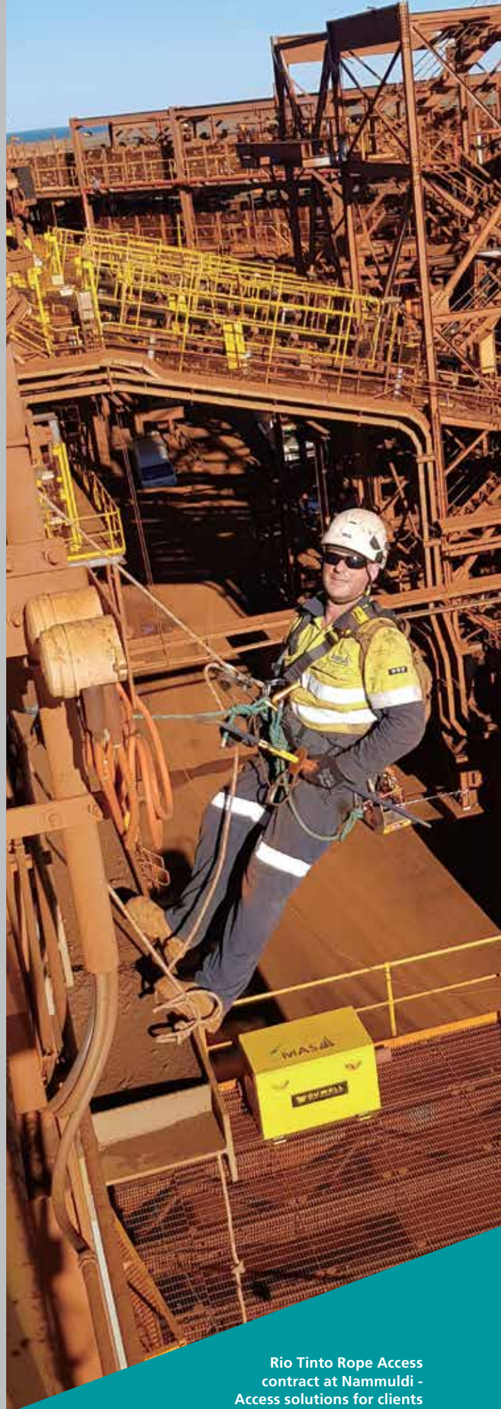
Rio Tinto Rope Access contract at Nammuldi - Access solutions for clients