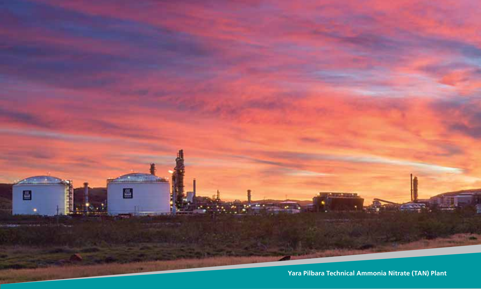
Yara Pilbara Technical Ammonia Nitrate (TAN) Plant